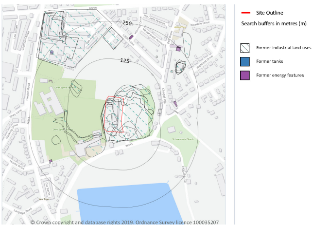
Groundsure Historical Land Use Database