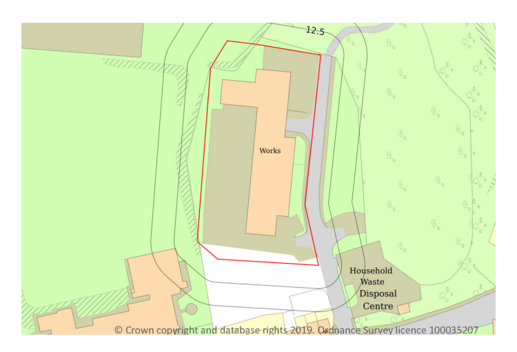
OS MasterMap site plan